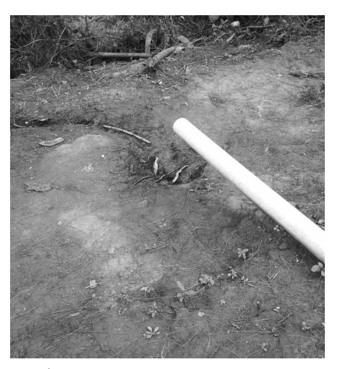
Figure 1 | Wastewater outlet and drainage from a water point, Chikwina-Mpamba.

Respondents' willingness to reuse greywater depended greatly on both the type of greywater and the reuse