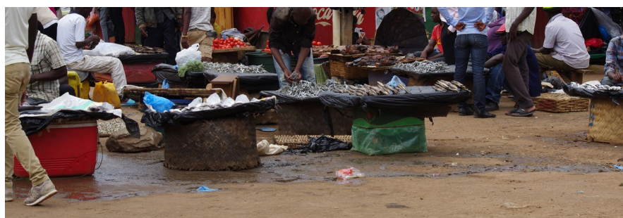
FIGURE 1 Fresh fish being sold at an open-air market, Mzuzu, Malawi

The study was conducted in Mzuzu City, Malawi, which covers 146 square kilometers and has a population of 220,000 according to the 2018 census (Malawi Government, 2018). There are 15 open-air markets in the city, which provide products for daily consumer demands, including local fruits, vegetables, grains, and protein (Figure 1). For 76% of households, a food market can be reached in less than a 30-min walk (Mzuzu City Council, 2014).