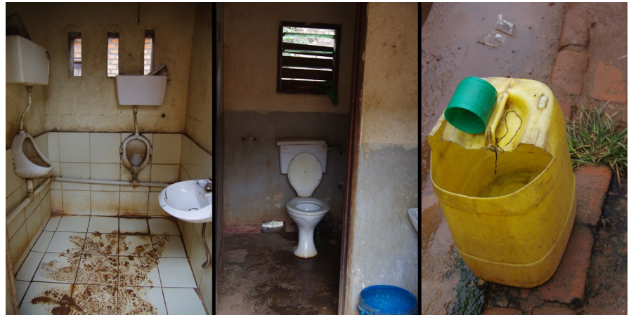
FIGURE 3 Urinal, flush toilet, and handwashing station infrastructure near Mzuzu Central Market fish vendors

a consistent temperature. No vendors actually monitored the temperature; no thermometers were present or used by vendors. When using ice, vendors reported getting it from a shop within the market area; they did not make their own ice. For the mobile vendors, fish were not covered with block ice, a sunlight barrier, or a dust barrier.