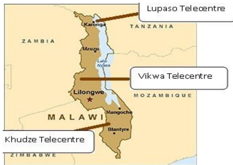
Figure 1: Map of Malawi showing location of telecentres

Figure 1 shows the location of the telecentres on a map of Malawi.